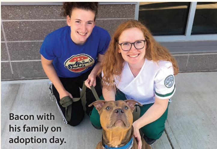
Bacon with his family on adoption day.

Bacon's new family said the foster period was extremely helpful for getting to know him without the pressure to make it permanent right from the start. But to everyone's delight, once Bacon was in a home environment, his playful, cuddly personality emerged! He's now happy, healthy and loved dearly.