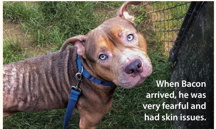
When Bacon arrived, he was very fearful and had skin issues.

Bacon's story is one example of how our B&E Program allows us to help dogs and cats with behavioral challenges such as fearfulness, and undesirable behavior like jumpiness and mouthiness. These issues can make potential adopters reluctant to commit. That's where our foster-to-adopt program comes in.